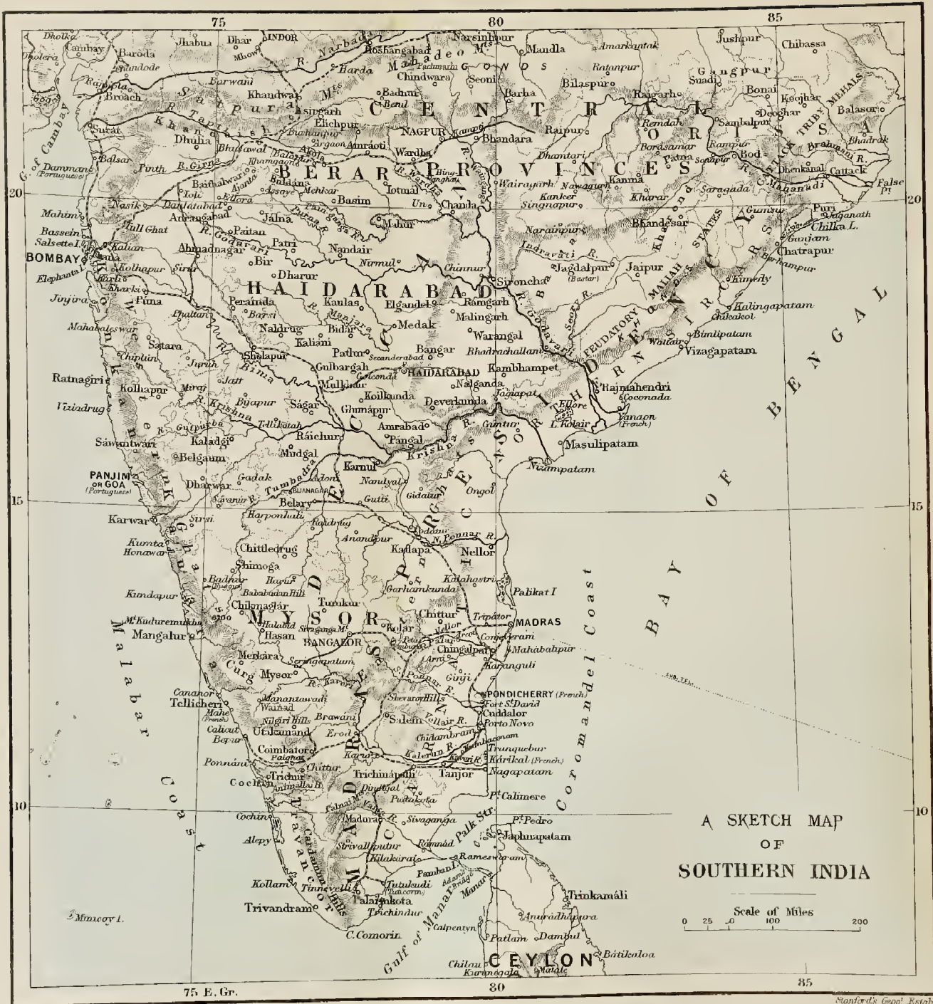
A SKETCH MAP OF SOUTHERN INDIA